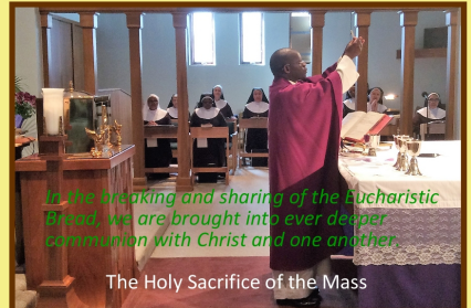
The Holy Sacrifice of the Mass