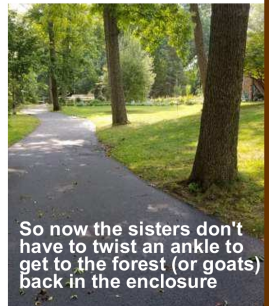
So now the sisters don't have to twist an ankle to get to the forest (or goats) back in the enclosure