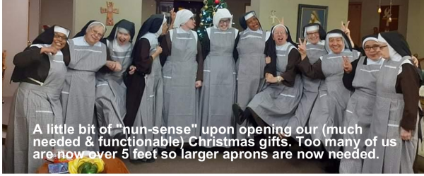
A little bit of "nun-sense" upon opening our (much needed & functional) Christmas gifts. Too many of us are now over 5 feet so larger aprons are now needed.