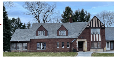
The St. Francis House where the proceeds will be used for its renovation

Upcoming Pepperoni Sale May 14 June 18 July 1 October 16