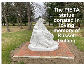
The PIETA statue donated in loving memory of Russell Gulling