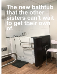
The new bathtub that the other sisters can't wait to get their own of.