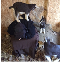
Some new additions to our growing Sancta Clara "Farm".

Included in the news of this correspondence we want to inform you about the continual growth of our Community Membership! Our Religious Family is seeing new faces and we are GROWING! In the days to come, we look forward to presenting these women to you in tandem with the events that would be unfolding for each of them. Please include in your prayers each of these potential aspirants and candidates seeking membership in our Eucharistic Household.