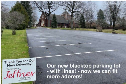
Our new blacktop parking lot - with lines! - now we can fit more adorsers!