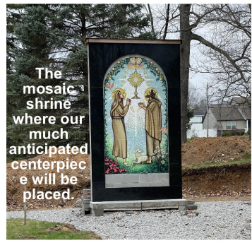
The mosaic shrine where our much anticipated centerpiece will be placed.